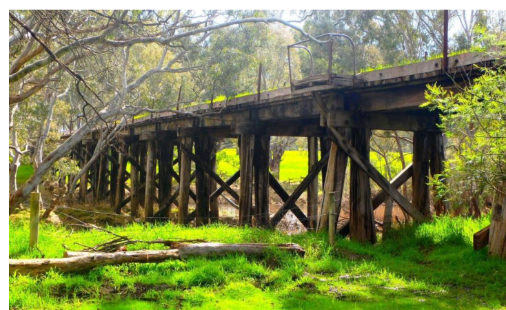
Spring at the Wannon Trestle Bridge.

We respectfully acknowledge the traditional owners of this land, the Gunditjmarra-Booandik people, their culture and their Elders past, present and emerging.