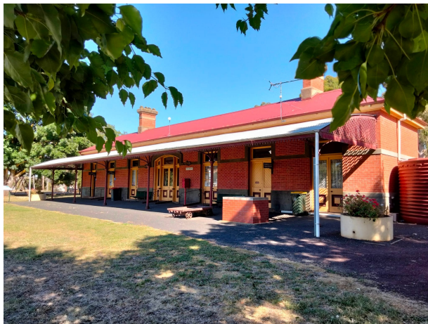
The Coleraine Station (built circa 1887)

All native Fauna & Flora is protected and to be respected, so, NO hunting! and please refrain from picking wildflowers.